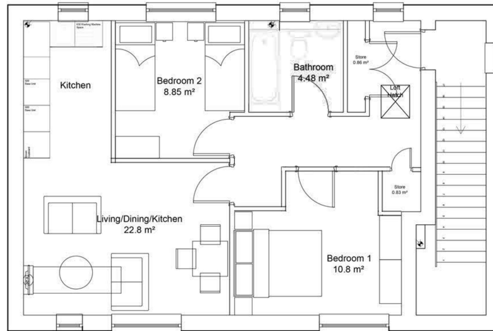
FIRST FLOOR PLAN 1:50

Type A1 - 47.3 m 2 (58.9m 2 including stairs)