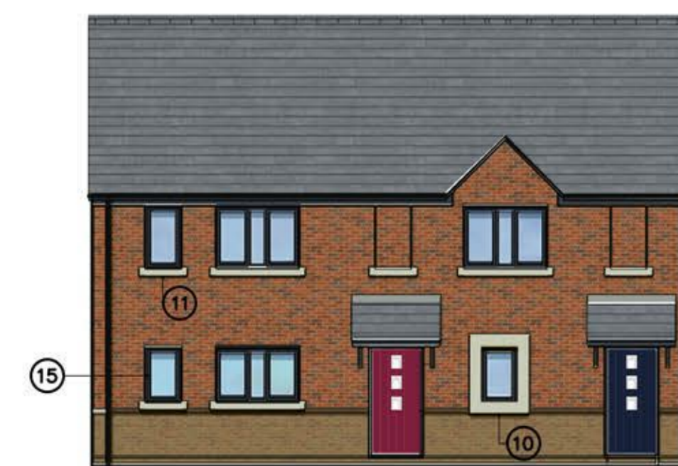
FRONT ELEVATION 1:100 CONTEMPORARY STYLE

UNIT E, PINWOOD, BELL HEATH WAY WOODGATE VALLEY, BIRMINGHAM, B32 3BZ TEL (0121) 421 8300 FAX (0121) 421 8210 © LOVELL PARTNERSHIPS LIMITED 2016