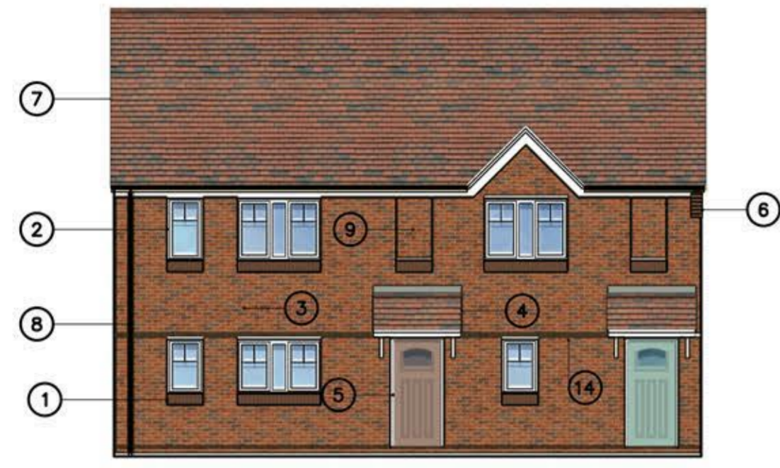
FRONT ELEVATION 1:100 TRADITIONAL STYLE