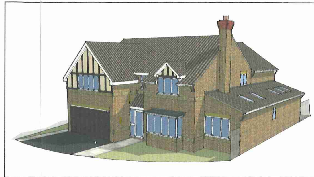
2 Perspective Views