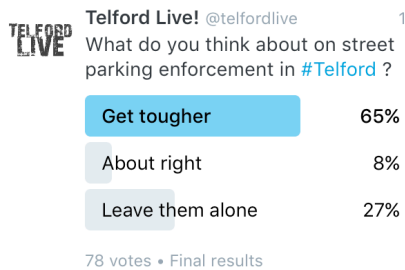
Figure 1 - Twitter Online Survey conducted by Telford Live

The lack of effective parking enforcement for on-street parking negatively impacts areas across the Borough and it is important to recognise the wider benefits of adopting CPE powers and the opportunities this could present to also more widely enforce issues such as dog fouling and littering.