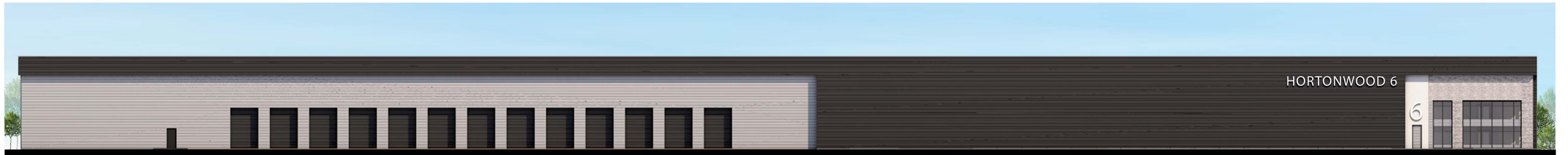
E-02 Elevation 1:200