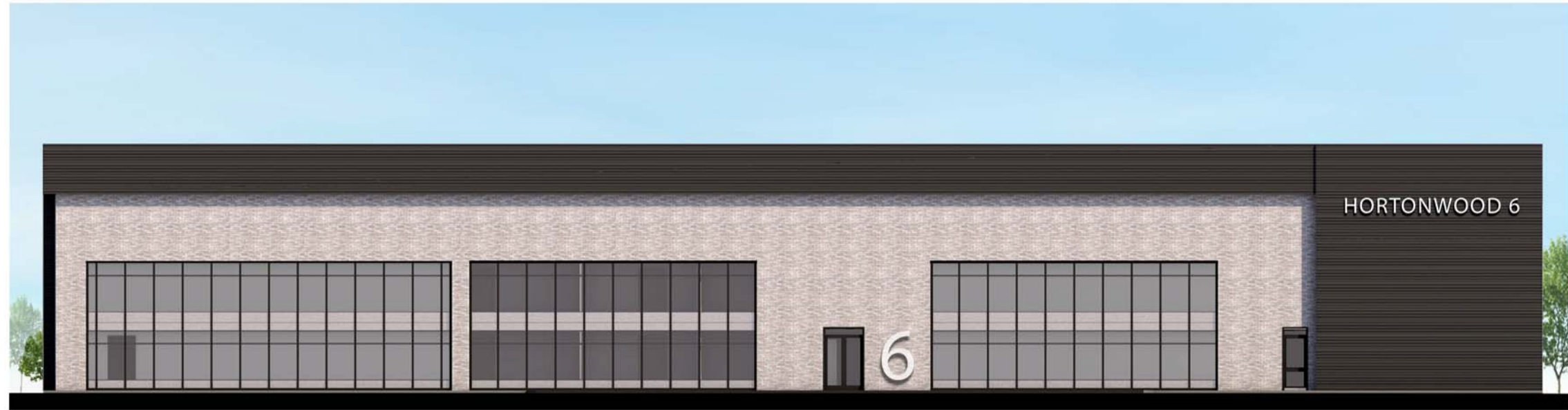
E-01 Elevation 1:200

Construction Risks, Maintenance/cleaning Risks, Demolition/adaptation Risks