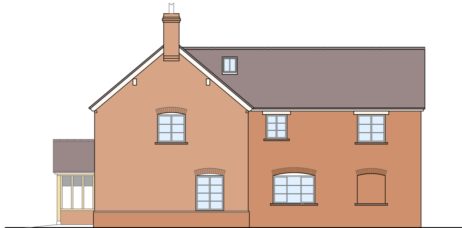
SIDE ELEVATION - EAST