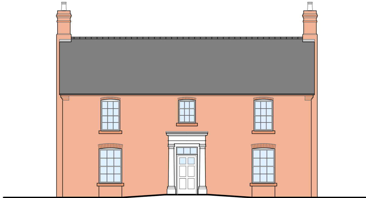
FRONT ELEVATION - SOUTH