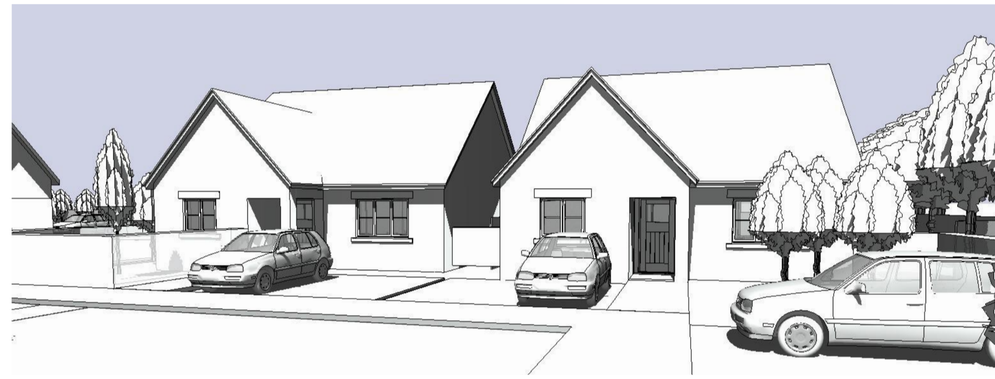
Typical Perspective 1:208.33