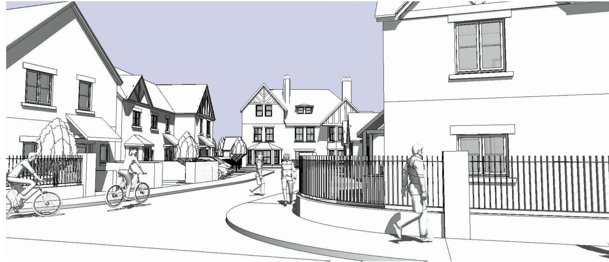
Typical Level site perspectives