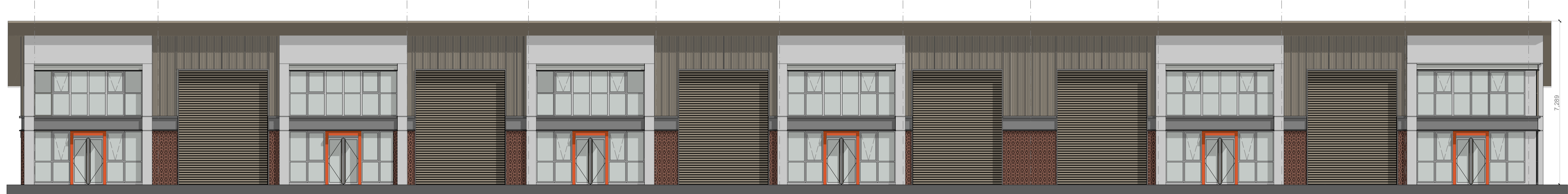
B1-B6 Entrance 1:100