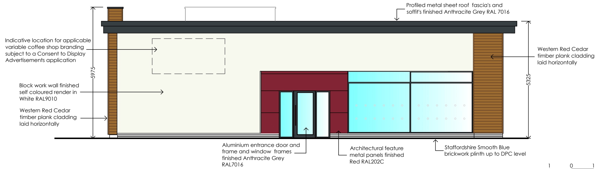
ELEVATION TO CUSTOMER ENTRANCE FACING INTO SITE TOWARDS FORECOURT SHOP