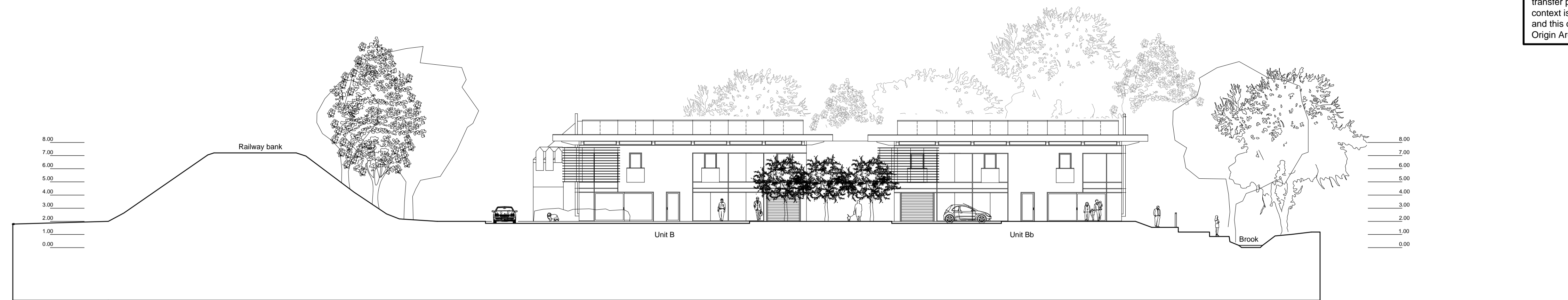
SECTION B - B (LOOKING SW)

Do not scale from this drawing. This drawing must not be used for land transfer purposes. Although every effort has been made to ensure scale and context is right, for indicative estimation only. All copyright on this drawing and this design is at all times reserved in both moral and intellectual right by Origin Architects Ltd.