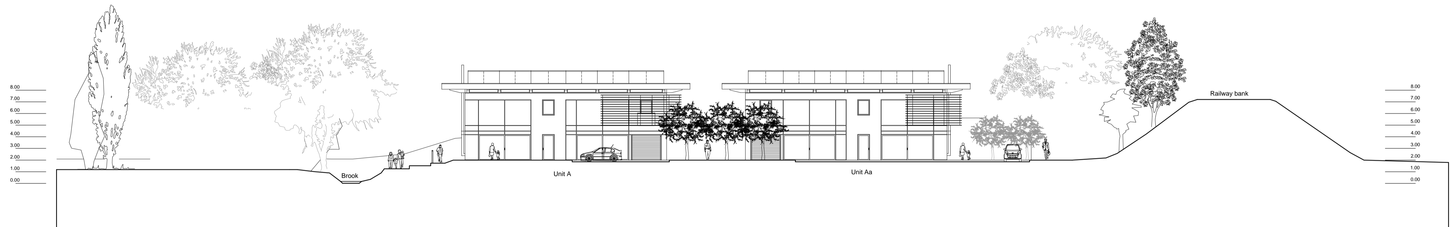
SECTION D - D (LOOKING NE)