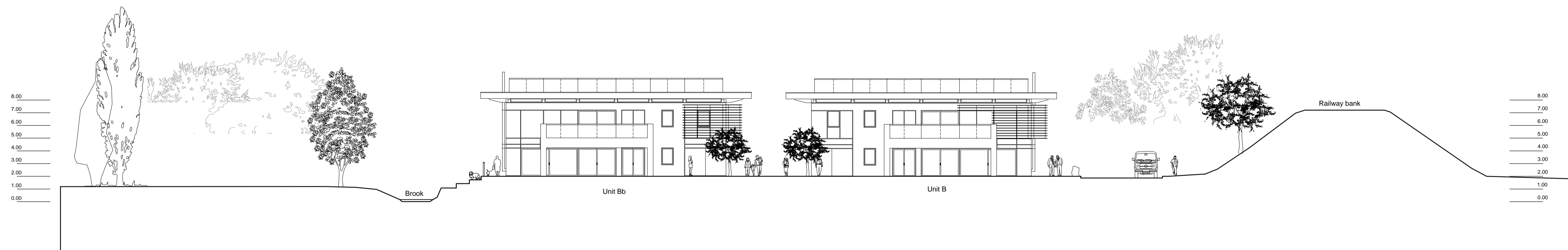
SECTION E - E (LOOKING NE)