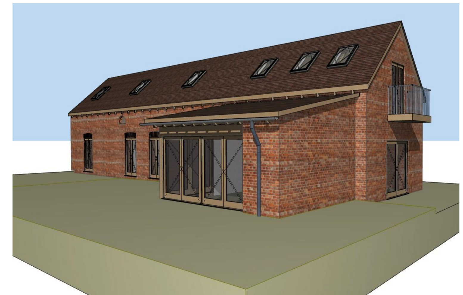
5 Generic Perspective (6) 1:208.33