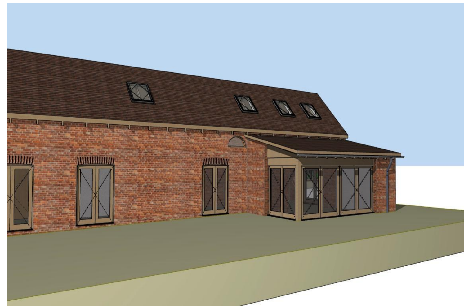
6 Generic Perspective (7) 1:208.33