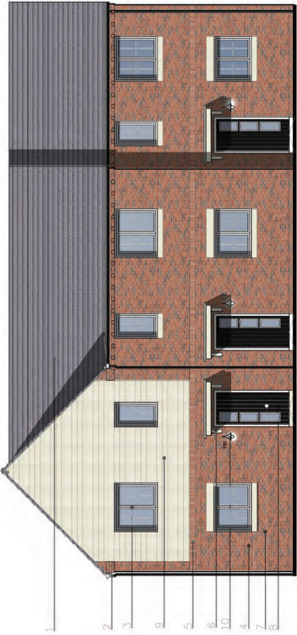
FRONT ELEVATION-PLOTS 1-2-3 HOUSE TYPE -D