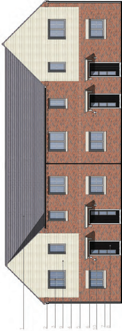
FRONT ELEVATION- PLOTS 6-7 HOUSE TYPE - D