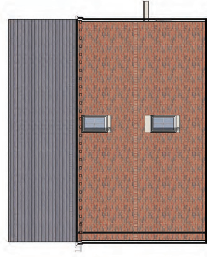
FRONT ELEVATION- PLOTS 4-5 HOUSE TYPE - C