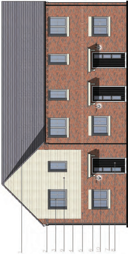
FRONT ELEVATION- PLOTS 8-9-10 HOUSE TYPE-C