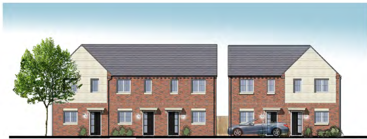
Section B-B Plots 08-12