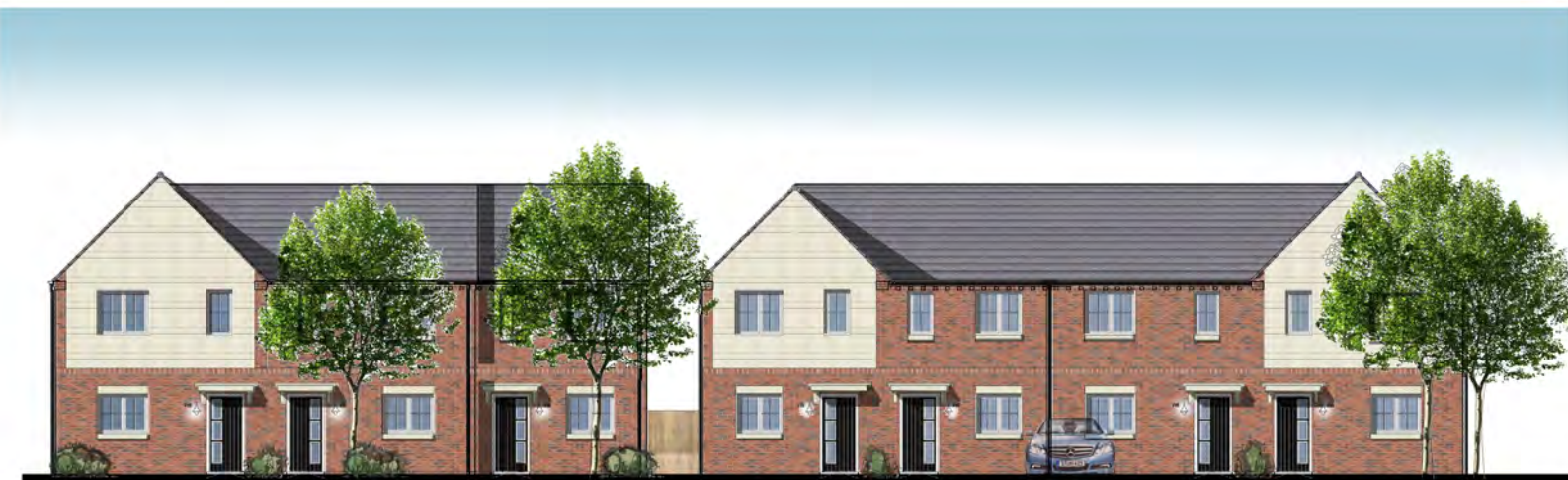
Section A-A Plots 01-07