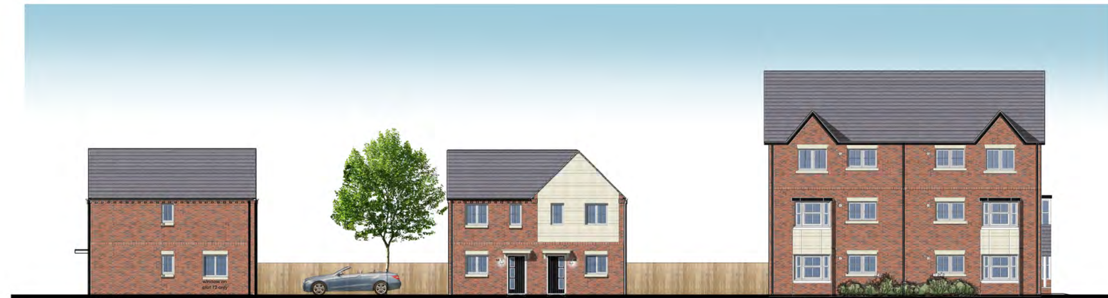
Section C-C Plot 12-26